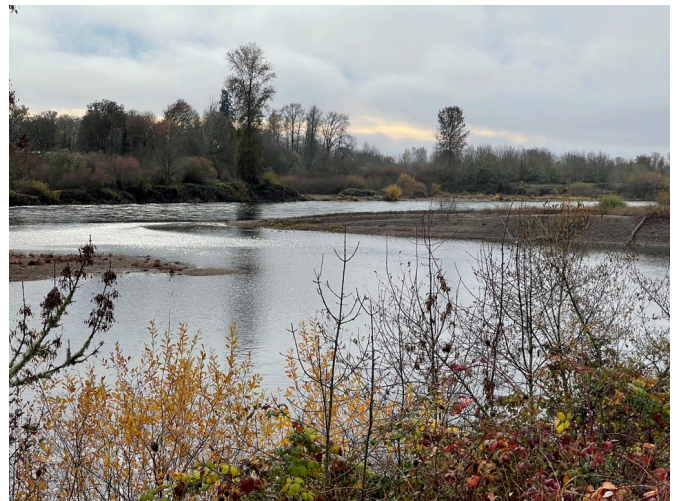
Winter water Willamette Park

From North Pacific Yearly Meeting Faith and Practice . Copies are available from the Meeting and online at nypm.org